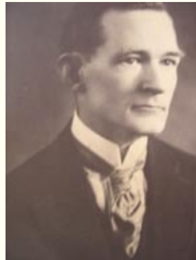
William. D. Gann

The Gann techniques will be explained and you will be shown examples of how it is possible to prepare for future events so that you can make buy, sell or hold decisions based upon the given facts at that time. As the preparation is derived from past events, we will stress the importance of using accurate historical data that should cover as many years as possible.